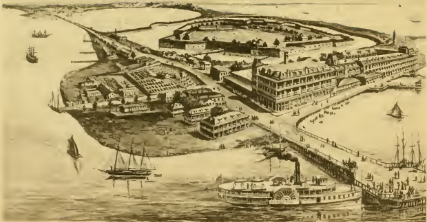
BIRD'S-EYE VIEW OF OLD POINT COMFORT, VA.